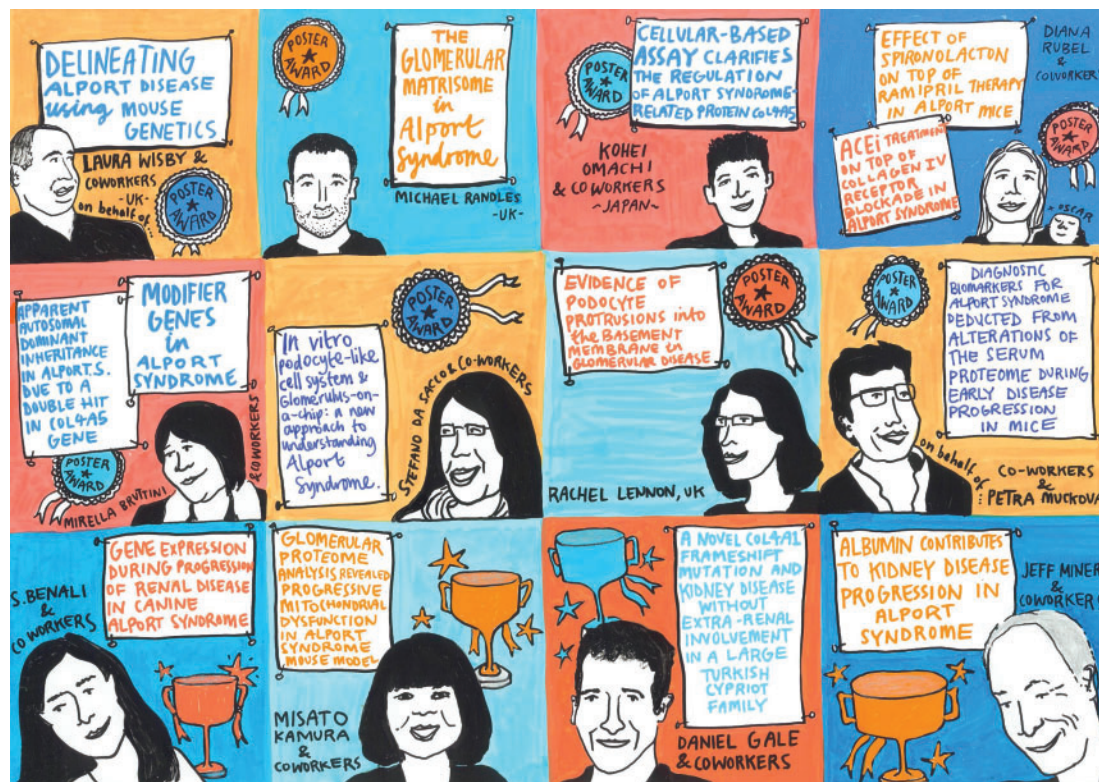
FIGURE 2: Poster prizes and young investigator awards of the 2015 International Workshop on Alport Syndrome.